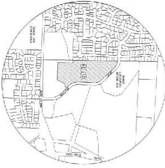
VICINITY MAP SCALE: 1"=800'